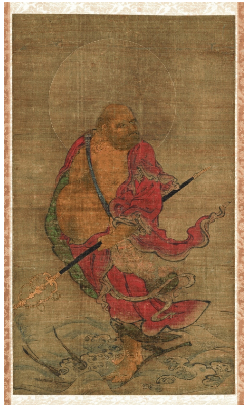
Bodhidharma Crossing the Yangzi River on a reed Painter unknown, Japan, Nanbokucho period (1336-1392)

BODHIDHARMA: A Brahman from Southern India. His spiritual wisdom was expansive. All who heard him became enlightened. He was devoted to the Mahayana practice of the profound solitary mind. He attained high comprehension of all aspects of samadhi. Through compassion for this place [China] he taught the Yogacara [teachings]. He first arrived in South China during the Liu-Song dynasty [before 489 C.E.]. At the end of his life he again traveled to live under the Wei [the dynasty that ruled North China]. Wherever he went he taught Chan. . .